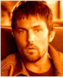
DESMOND HARRINGTON as Sam Cutter

Desmond was born in Savannah, Georgia, but moved to his parents' native Bronx, New York at age 3, where he attended Catholic schools. Desmond found trouble in and out of school throughout his formative years. After high school, he took jobs as a laborer, a landscaper, a cold caller at a brokerage firm, and finally a bartender in Manhattan, where a co-worker invited him to attend an acting class. That changed the course of his life.