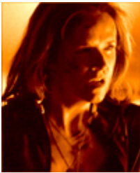
LEA THOMPSON as Maudie McMinn

Additional film and television credits include TiMER , FORT PIT , LIFE MAKES SENSE IF YOU'RE FAMOUS , MY FIRST MISTER , NOT SINCE YOU , and LAW & ORDER: CRIMINAL INTENT .