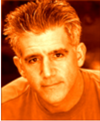
GREGORY JBARA as Coach Jerry Yarbrow

appeared in MOONLIGHT, CSI: MIAMI, PHIL OF THE FUTURE and QUINTUPLETS.