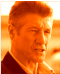
FRED WARD as Sgt. Archibald Sparks

An all-around triple threat performer, Lea also has appeared in many stage productions, including THE LITTLE MERMAID, BUS STOP, THE ILLUSION, LONG TIME COMING, CHARLIE BACON'S FAMILY, THE TRIP BACK DOWN, VAGINA MONOLOGUES, and as "Sally Bowles" at Studio 54 in the Broadway revival of CABARET.